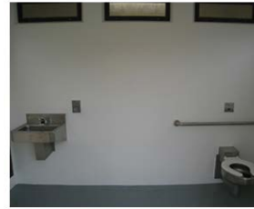
Interior with Stainless Steel Fixtures