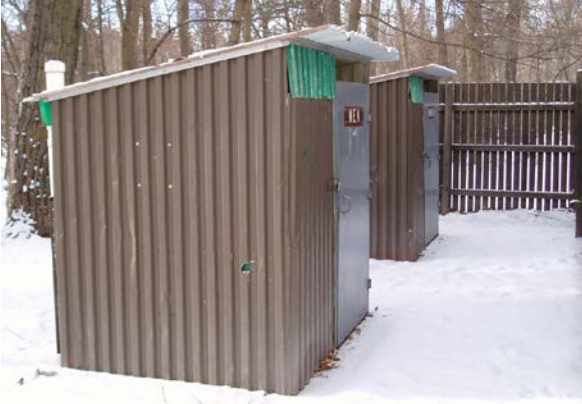
Former restrooms - destroyed by wind felled tree Sept 2015