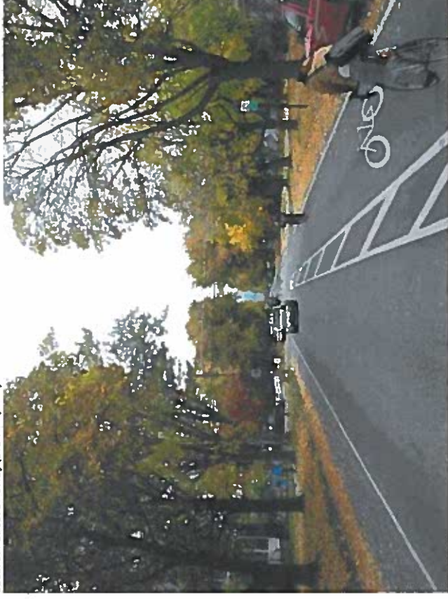
Hickory & 5th Street Facing West