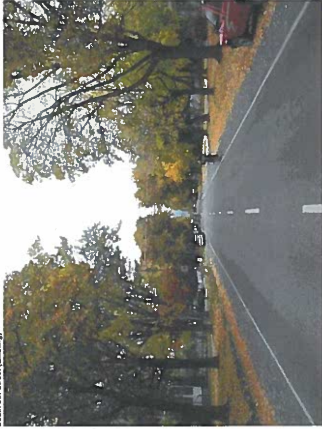
Hickory & 5th Street Facing West